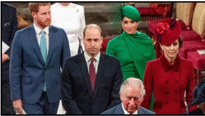
While Harry and Meghan step out of the spotlight, William and Kate continue to carry out the traditional royal roles and expectations.

details of Meghan's solo visit to a school in Dagenham, where she marked International Women's Day in the east London town where female sewing machinists from the Ford Motor Plant held a strike for equal pay in 1968.